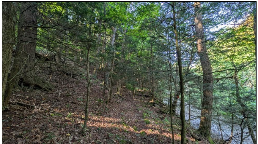
Figure 1. Photos of HWA treatment areas at Watkins Glen State Park that require ropes.