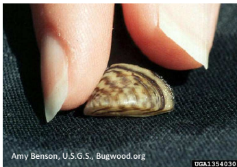
Zebra Mussel- 0.25—1 inch in length.