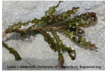
Curly-Leaf Pondweed- Submersed aquatic, usually first plant up, dies back mid-summer.