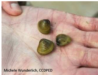
Asian Clam- Oval-triangular clam shape, less than 1.5 inches in length.