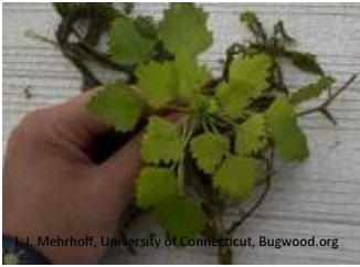
Water Chestnut- Forms dense floating mats, seeds have four sharp spines.

Otisco Lake contains the following harmful invasive species: