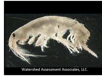
Scud (Echinogammarus ischnus)- Less than 0.5 inches in length

Help prevent the spread of these and other harmful invasive plants and animals between our lakes and streams.