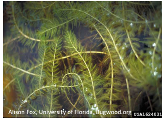
Eurasian watermilfoil- 12-21 pairs of leaflets, forms dense mats.